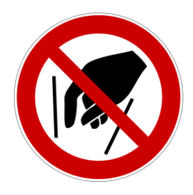
Do not put hands inside.