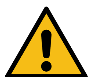
Not for hard disks.